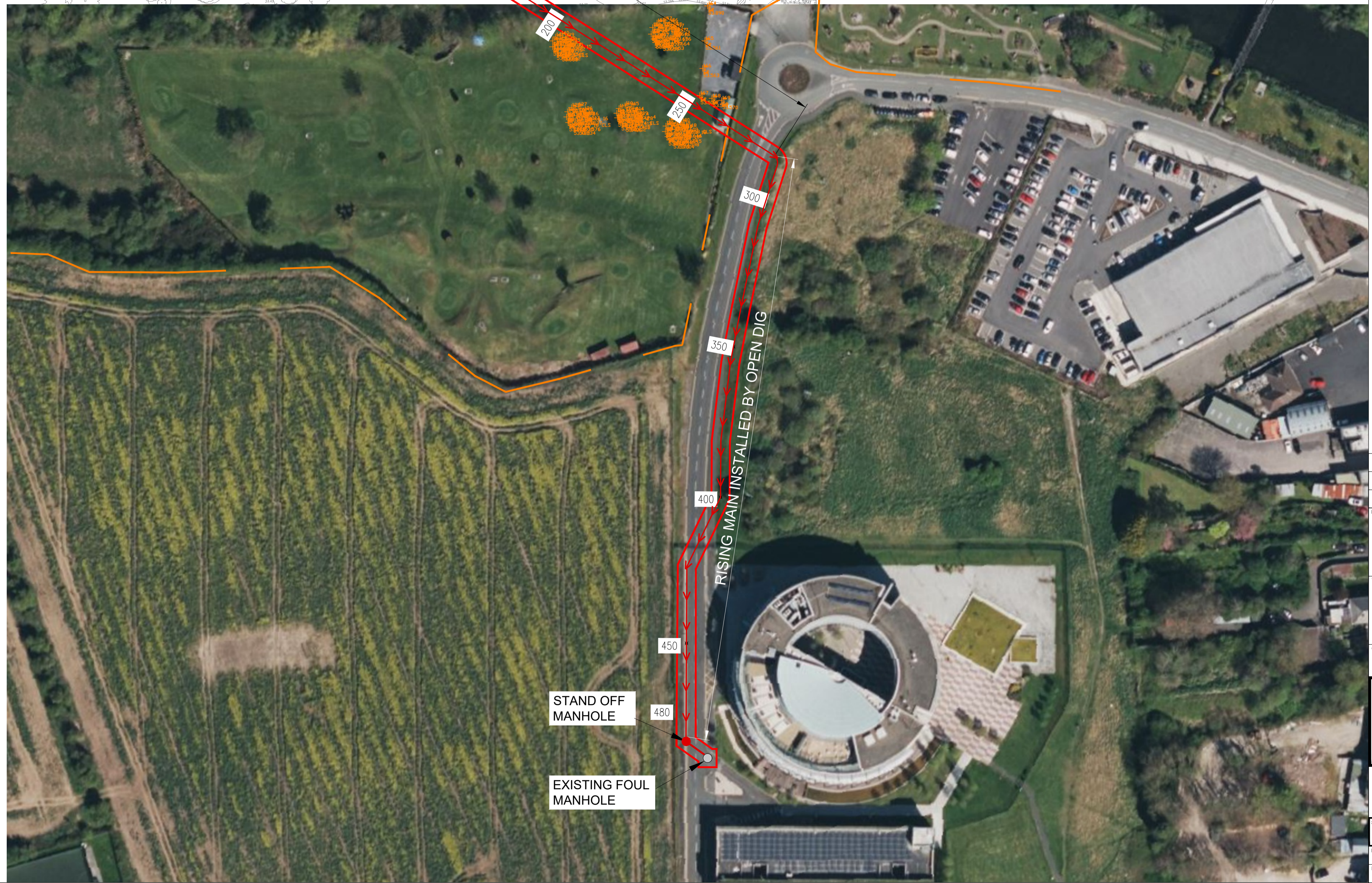
PLAN VIEW – PROPOSED RISING MAIN – GENERAL ARRANGEMENT PLAN N.T.S.